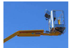
Fly jib (option)