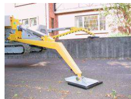
Easy set up