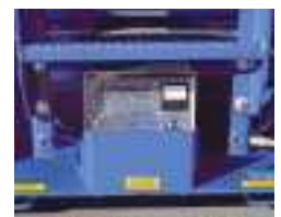
Easily-accessible rear-mounted battery charger allows operation during charging. Swing out modules allow access to all service components in seconds, encouraging regular maintenance.

Meets or exceeds applicable requirements of OSHA and ANSI A92.6 - 1999. CE This product is available with the CE mark confirming compliance with all relevant European Machinery Directives