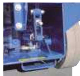
Non-marking tyres are fitted as standard to protect floor finishes.